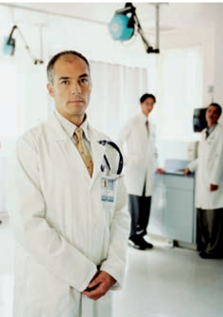
Medic - health care edition