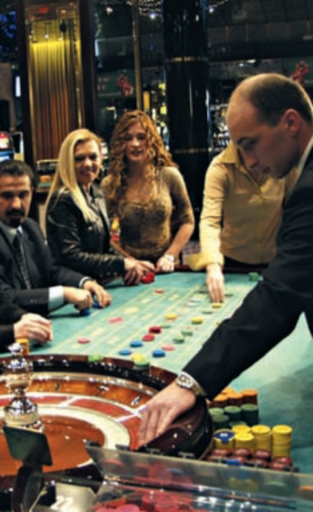
Joker - casino edition