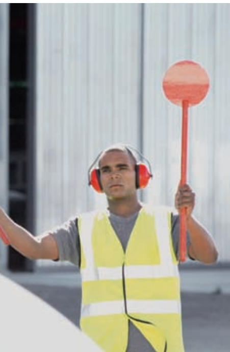
Icarus - airport edition