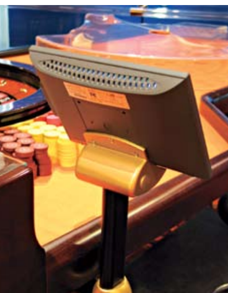
Table Pilot casino management system as a casino intelligence support

ICIT is currently developing a new and comprehensive system intended to provide support to gaming floor managers – the Smart Table Management System. This system combines game and casino resource management , including player, money and chip tracking functionalities , into a complex casino intelligence system.